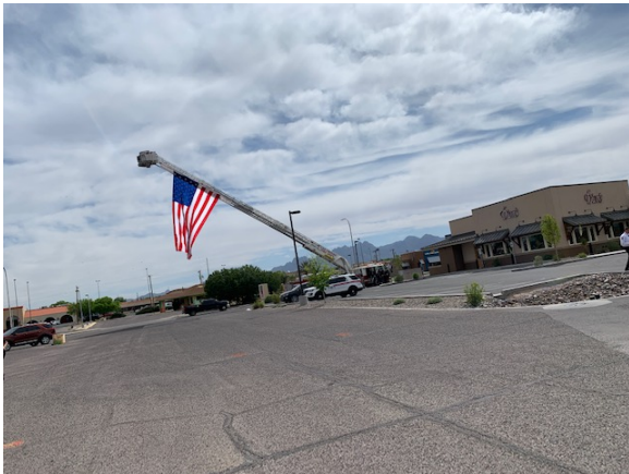
Southern New Mexico Fallen Peace Officer's Memorial service

845 N. Motel Blvd. Second Floor, Suite D Las Cruces, NM 88007 (575) 524-6370